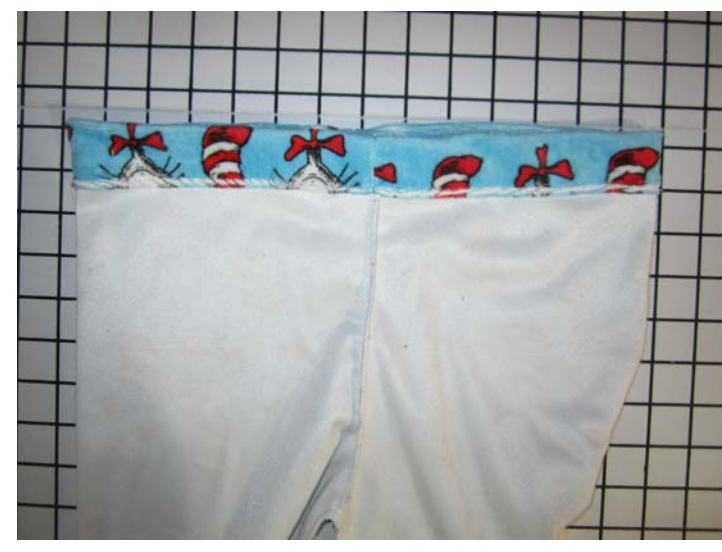
Step 5: Now we can sew 1/8" up from the bottom of our fold all the way around the waist being sure to leave a 1.5" opening as shown to the right.