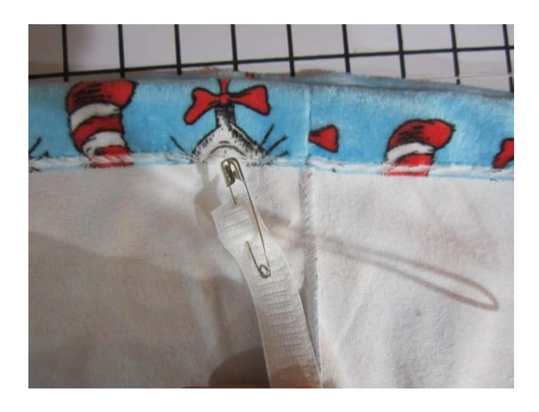
Step 6: Using a safety pin, thread the 3/4" elastic through the waist casing making sure that it doesn't twist while doing so. When we reach the end, sew the two elastic ends together again making sure that it is not twisted.