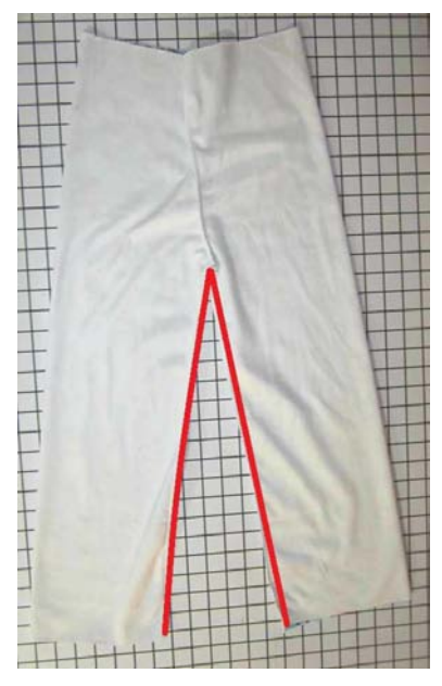
Step 2 : Line up the two crotch pieces, as shown to the leftt with right sides together and pin. The two seams we have just sewn will now be going down the middle of the front and back. Sew along the red line as indicated. It should now begin looking like pants!