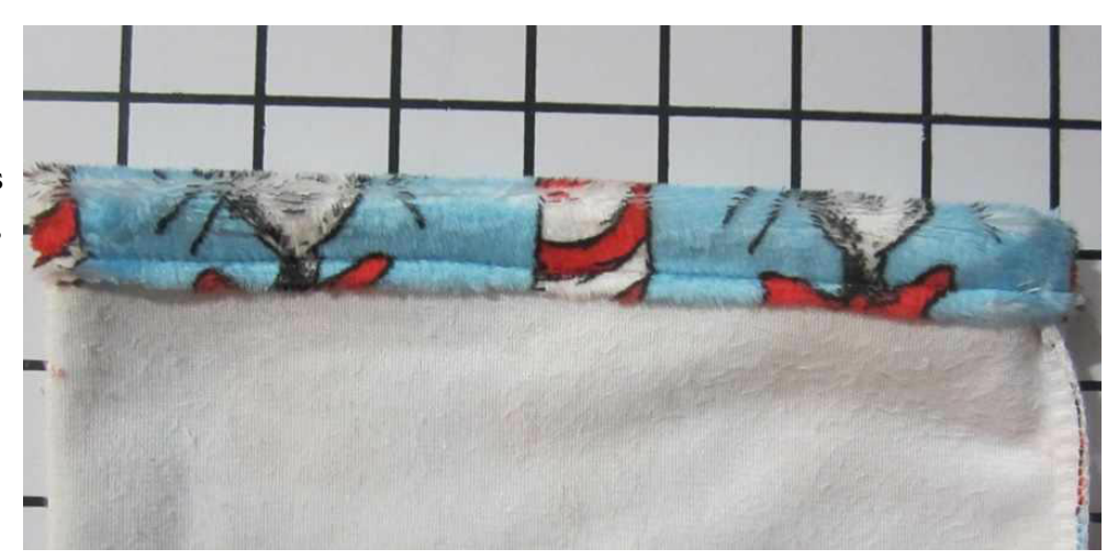
Step 3: We will now hem the legs by folding the bottoms back 1/4", ironing, folding back an additional 3/4", ironing, and sewing 1/8" down from the top.