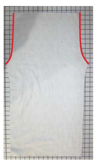
Step 1: Take both of the pants pieces, put them right sides together, and sew around the two curves shown in red to the right. This will become the front middle and back middle of our pants.