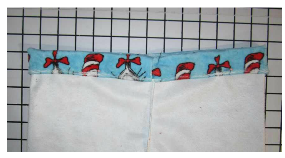
Step 4: Starting at the center of the back of our pants, fold back and press 1/4" down all the way around. Now we fold over an additional 1" down and iron pinning as we go making sure to match up seams at side.